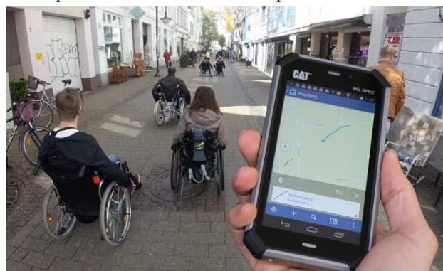
Fig. 2. Students in wheelchairs “exploring” the city of Oldenburg, Germany.

the same time missing Places of Interest (POI) were evaluated and added to the “Wheelmap”. If necessary, already existing POI were reviewed and updated on the basis of actual information gathered during the trips. An employee of the university, a wheelchair user herself, supported the project with practical advice and accompanied the students in this experiment.