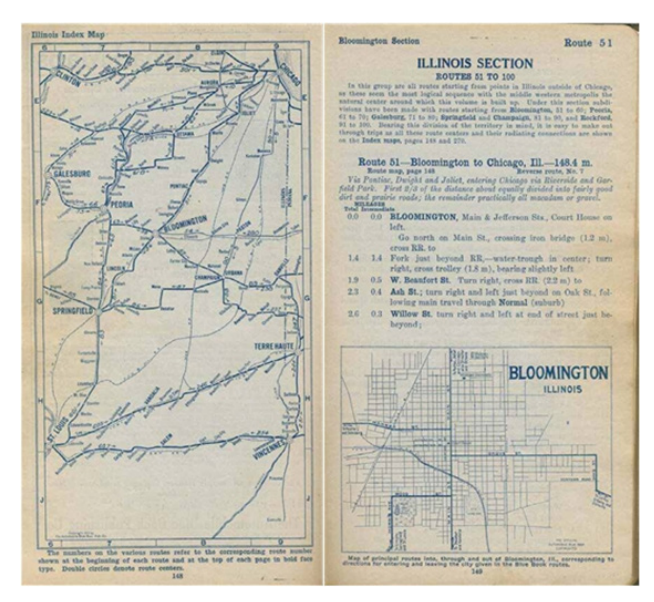
Fig. 1. Route index map, urban map, and beginning of Route 51. (Source: Official Automobile Blue Book, Vol. 4 The Middle West, 1910, p. 148-149.)