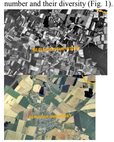
Fig. 1. Changes around Beauvoir between 1958 and 1990.

infrastructure managed by CNRS, each "Zone Atelier" targets a scientific contribution to questions of sustainable development, in a perspective of use and long-term sharing of resources, spaces and territories (Leveque et al. 2000). More than half of the study site has been designated as a NATURA 2000 site in 2003. Road mesh and tree hedges, that play a fundamental role in natural habitats structure, have all been digitalized by photointerpretation in 2005 of orthoimagery, and updated with 2011 and 2014 data. Furthermore, a set of aerial photos taken in 1958, 1969, 1982, 1990, 2002, 2007 and 2011 have been georeferenced and assembled. Put side by side, those images give an astonishing view on the evolution of the area with the systematic extension of the area of agricultural parcels and the reduction of their