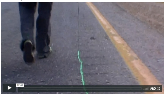
Fig. 4. The Green Line. Francis Alÿs. Jerusalem 2004. (Source: artist's website. Available in: http://francisalys.com/the-greenline/. Accessed 22 Feb 2017)

drawn by a military commander, using a green pencil on a map (Harmon & Clemans 2009), and it separated some disputed Palestinian territories in the West Bank. This demarcation had an extensive impact in local population. From both sides, their lives were affected by administrative, cultural, religious and security issues. Although that demarcation line was officially removed some decades later, its effects are still present. Since then, the line became a clear example of how an artificial decision on a map could impose power relations over a territory.