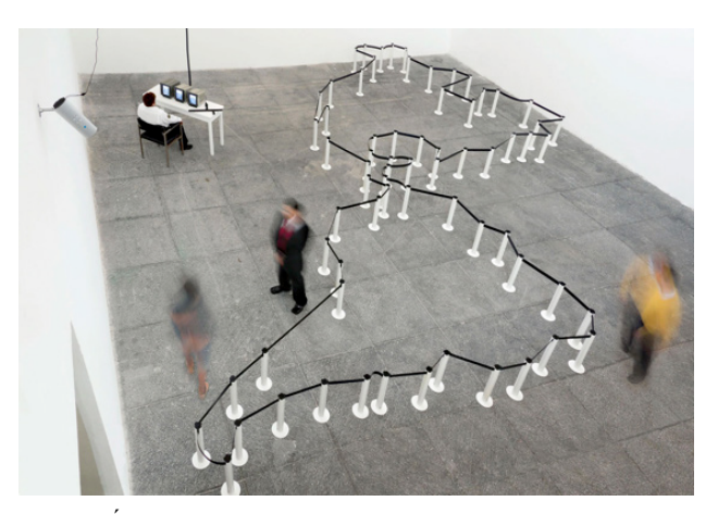
Fig. 1. Área Restringida, Mateo Maté. Sala de Arte Siqueiros, México D.F. 2011

The second artwork in the figure 2 is called Upotia, created by Nicolas Desplats. These are six closed buckets, typical paint cans used on walls and other surfaces. Each bucket contains a label that covers the whole side surface. These labels show the title of the artwork in large characters, as well as other explanatory texts. The lid of each bucket shows map images, with common cartographic elements such as meridian and parallel lines, roads, city names, and borders. These buckets appear to be tightly closed, not showing any sign that they might have been opened. Each bucket also contains names of islands that are situated between the cities of Marseille (where the art-ist lives) and Toulon, where the exhibition took place (Monsaingeon 2013).