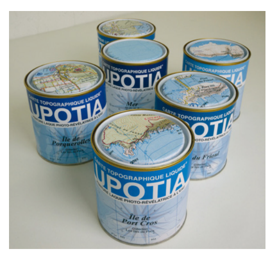
Fig. 2. Upotia: les îles de PACA, Nicolas Desplats. Mappamundi exposition, Hôtel des arts, Toulon, France, 2013.

The third example comes from Francis Alÿs, a Belgian artist that proposed performances in two of the most controversial borders worldwide: the US-Mexico border and the Green Line in Israel. In 1997, Alÿs was invited to join the InSite exhibition held in the San Diego-Tijuana border region. For this exhibition, Alÿs prepared a performance called The Loop: his purpose was to travel from Tijuana to San Diego without crossing the US-Mexico border. In order to accomplish this long and expensive journey, Alÿs did a circumnavigation around the Pacific Ocean (figure 3). His itinerary comprised the following cities: Tijuana, Mexico City, Panama City, Santiago, Auckland, Sydney, Singapore, Bangkok, Rangoon, Hong Kong, Shanghai, Seoul, Anchorage, Vancouver, Los Angeles, and finally San Diego. With this performance - an extravagant and wasteful trip - Alÿs criticizes the economic and political obstacles that Mexicans are facing. Therefore, crossing that border is privilege that is allowed only for few people.