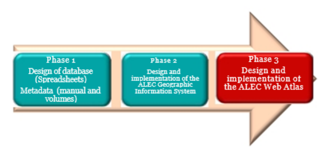
Fig. 2. Phases of the Interactive ALEC project.