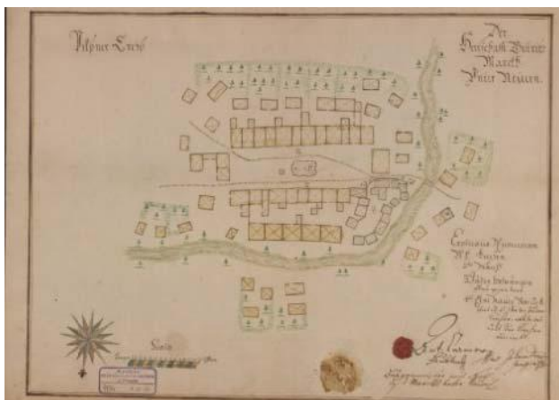
Figure 1. Example map from the set - hand-colored map of the town of Dolní Nýrsko from 1727 with a floor plan of the Church of the Fourteen St. Helpers. Scale 1:1294. National Archives of Prague, Collection of Maps and Charts, inv. no. 1174, sign. A/XII/16.