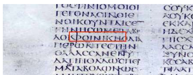
Figure 1. The word Phoinikes written in the Codex Sinaiticus , a Fourth-Century copy of the Septuagint.

For the first time, the Levantine coast is under the suzerainty of those who thought of it as Phoenicia, be they Seleucids or Ptolemies. Local culture began to adapt. One of the earliest examples might be the Septuagint translation of the Hebrew Bible, done in Egypt during the 3 rd and 2 nd Centuries BCE. The "merchants of Sidon" mentioned in Isaiah 23:2 was translated into Phoinikes , "Phoenicians" 7 . The introduction of Phoenicia into the Hebrew Bible was not universal: "Canaan" and "Canaanites" continued to be used in most occurrences (Quinn, Op. Cit. , 37).