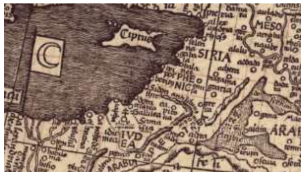
Figure 4. The Waldseemüller Map of 1507 CE, a detail showing Syria, Phoenicia, and Judaea.

same time, on the same map, with the very newly named America.