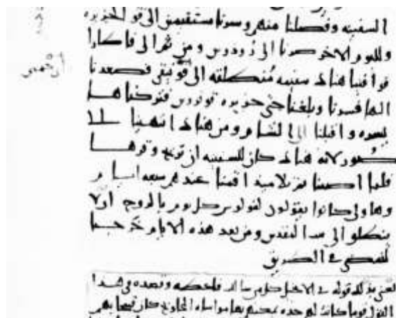
Figure 3. Acts of the Apostles 21, from the Mount Sinai Codex 151 (c.867 CE), with the translation of Phoenicia into Fûniqi and the note to the left “It is Homs.”

The local Rûm Melkite 23 population, Arabised or Greek-speaking, continued to use the toponym “Phoenicia” in their geography. The Mount Sinai Codex 151, maybe the oldest surviving translation of the Bible into Arabic (before 867 CE) 24 , uses the word Fûniqi 25 to translate Acts 21:2 26 . This translation might be the oldest version of the Arabic name of Phoenicia. In the same chapter, Jerusalem is translated into Bayt El Maqdis 27 , and Syria into El Sham 28 . But Phoenicia is transliterated: would this fact mean that there was no equal Arabic word? The translator adds a note on Fûniqi , explaining that “It is Homs [Emesa]” 29 , the ancient metropolis of Lebanese Phoenicia 30 (Saint Catherine’s Monastery, Image 237) 31 .