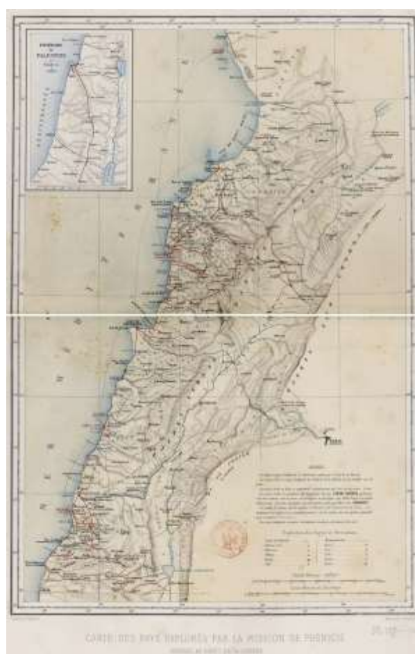
Figure 5. The map of the places explored by the Mission de Phénicie , by Ernest Renan (From the Planches ).

The international conditions were rather propitious: after the 1860 civil war in the Levant, the French expédition de Syrie disembarked in Beirut in August 1860, in the name of protection of Christians. In October, the Mission de Phénicie was created by a ministerial decree (Robin, Op. Cit. , 135), some weeks before Renan’s arrival in Beirut 48 .