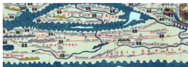
Figure 2. Tabula Peutingeriana , detail with the toponym “Syria Phoenix.”

The Tabula Peutingeriana or Tabula Theodosiana 16 , a medieval copy of a Third-and-Fourth Century cursus publicus map, shows the political unit as “Syria Phoenix.” By then, along with all the Roman provinces between the Taurus mountains and Sinai, Phoenicia was a part of the Civil Diocese of the East in Antioch 17 , established in the late Third Century CE and was of exceptional military and commercial importance to the Roman Empire. In this East, Phoenicia was “a province full of beauty and elegance,” with Tyre as capital, followed by Sidon, Berytus, Emesa, and Damascus, according to Marcellinus (†c. 400), himself a native of the region (Marcellinus, 1911, 28).