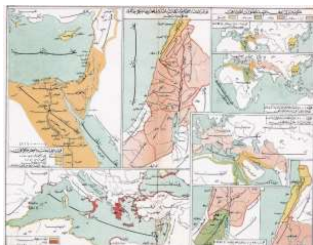
Figure 7. Maps from the Ottoman Esref Atlas, a detail showing the "state of Phoenicia" as the neighbour of the Twelve Tribes of Israel and the later kingdoms.

Later, the atlas used by the Ottoman Military College uses "state of Phoenicia" 55 abundantly and makes it a state contemporary to the Twelve Tribes of Israel, then to the Two Hebrew kingdoms of Judaea and Samaria (Esref, 1913).