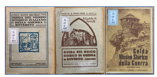
Figure 6. Museo Storico Italiano della Guerra, Archivio Storico, Frontespizi delle guide (1925, 1932, 1955)

By reading such documentation it is possible to create a first indicative list of the pieces in the collection. In particular, we will devote our attention to the most geographic models and not to those aimed mainly at the creation of individual artifacts. "In order to get an exact idea of the area where the dependent troops fought, in order to further study the actions and to know our and the enemy's positions, evaluate their strategic or tactical importance, the possibility of conquest and the difficulties of the assault, the main commands (division, army corps, army) were supplied with models" (Ceola, 1927, p. 69). These were designed to provide a visualization of the morphology of the land and its topographical configuration.