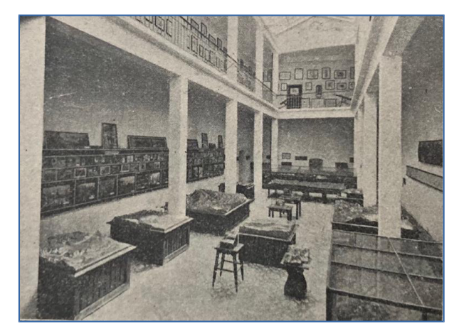
Figure 7. The 'Museo Storico Italiano della Guerra', Historical Archive, Guida del Museo Storico Italiano della Guerra in Rovereto (Trentino) , Rovereto, Tipografia Mercurio, 1930, p. 26.

The study of these models is complicated by the scarcity of contextual sources directly attributable to them. However, the continuation of the research involves both the analysis of the administrative materials of the Museum and the study of their manufacturing processes. In this respect, the literature on topographical representation techniques of the time (instructions, manuals etc.) and on the connection with other still little known collections and deposits will also be addressed. Such study will allow to reconstruct the techniques, the