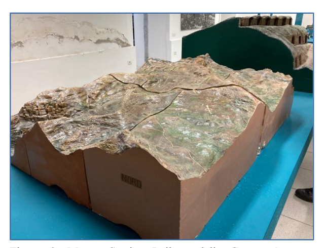
Figure 9. Museo Storico Italiano della Guerra, Armate in Miniatura . Collezioni del Museo della Guerra (Torbole).