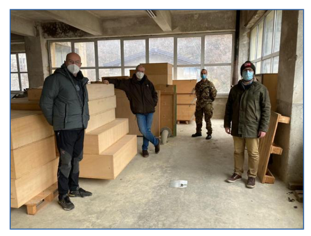
Figure 5. Italian War History Museum, inspection visit to the warehouses.

Almost all of the pieces that constitute the Museum's collection are currently not exhibited and kept in crates in the museum's warehouses (Figure 5).