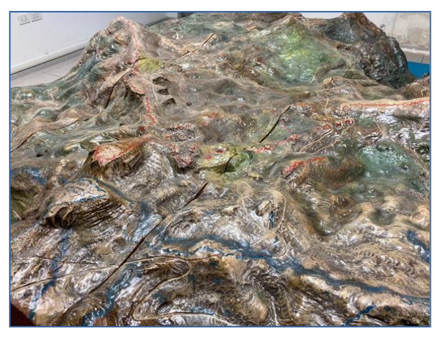
Figure 10. Museo Storico Italiano della Guerra, Armate in Miniatura . Collezioni del Museo della Guerra (Torbole).

If war events are more than known facts, it should be emphasized, however, that they have not yet been adequately addressed from a territorial perspective and using the geo-historical survey method. Let us not forget that, as Georges Duby has already explained, "history happens on the ground, and not just political history, but also that of institutions [...]. To develop his investigations, the researcher cannot go without geographical maps, since the geographical representation brings to light unexpected relationships between the facts he discovers" (Duby, 1992, p. 1). Based on these assumptions, the documentation relating to the case study will be collected within a single corpus and investigated. This will help to strengthen the identity of the places that recall or stage the memory of the Great War.