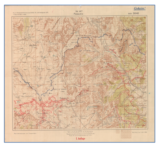
Figure 8. Pasubio: nach Fliegerbildern, Vermessungen und Truppenmeldungen, berichtigt bis 1/VIII.1918, Scala 1:10.000.