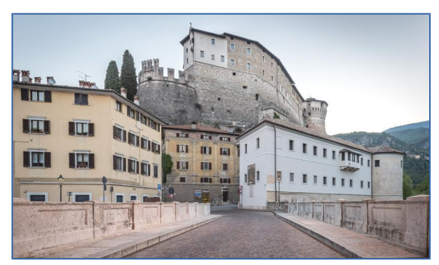
Figure 1. Rovereto Castle, seat of the Italian War History Museum

In the next paragraphs we will examine two specific collections, that of maps and that of models. These are only two of the numerous collections of the Italian War History Museum in Rovereto, one of the most important and well-known Italian institutions dedicated to the First World War (Antonelli, et al. , 2020). The museum was established in 1921 as a 'national monument', finding its seat within the castle of the town of Rovereto. Its purpose was to preserve the historical memory of war events of the early Twentieth Century. However, later on, it was also used for nationalist political propaganda (Rasera, Zadra, 2001) (Figure 1).