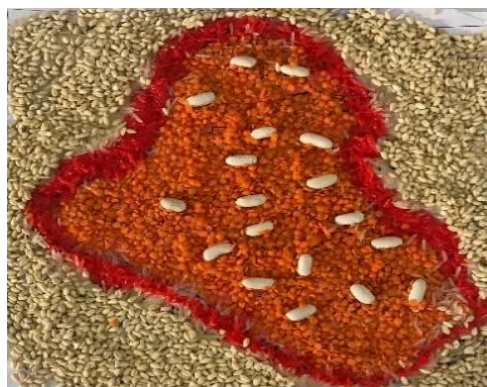
Figure 1: One of the handmade maps created by the students of the Runaki Center.

Most people prefer learning by the school to get convinced on the proper understanding of the mapping technicality of the Geographical Information Systems. People do not prefer learning the software at home since they lack the proper understanding of technicality; hence need to be taught by specialized people at the learning institutions, which offer the knowledge on ArcGIS software. By illustration of this motive, it is clear that ArcGIS has made people flood in learning institutions to obtain the technicality to utilize the software; besides obtaining this information, they would be able to improve the mapping technology. This is the main way to learn the braille system and the entire mapping, which makes the vision impaired individuals prefer the digital way to learn the mapping system than the traditional way of map use. The result from comparing both versions were that students preferred the new modern maps and rejected the old one made by hand as it shows in both Figures 1 and 2. Most of the students were satisfied with the new available technology in their schools for learning and using maps.