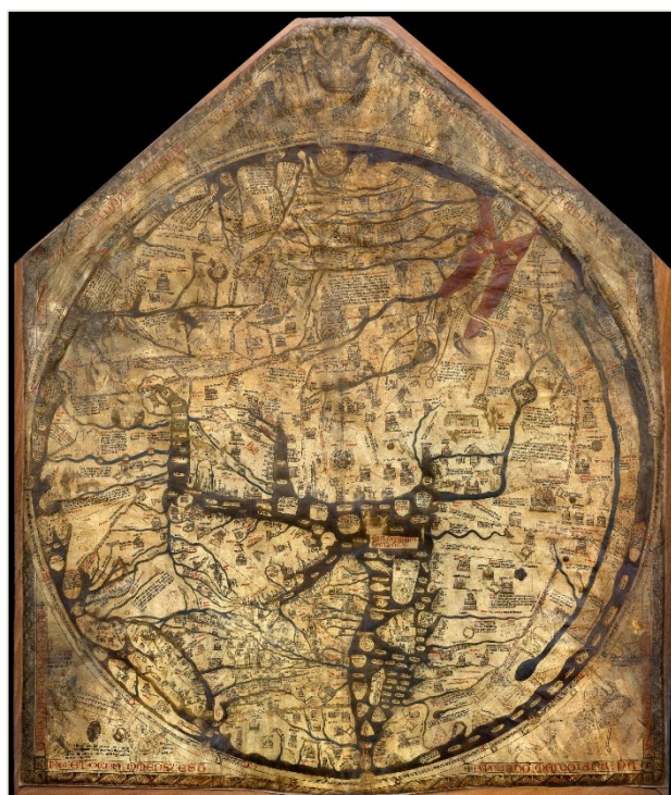
Figure 4. The Hereford Mappa Mundi is an example of the classic medieval manifestation of the T-O map, oriented to the East (at the top) with Jerusalem in the centre.

Oriented to the East, the central point of the map is occupied by Jerusalem surmounted by an image of the crucifixion, while the Last Judgment is depicted at the top with the Saved on the left, the Damned on the right and a Virgin with bare breasts praying for mankind (Ibid. p. 73).