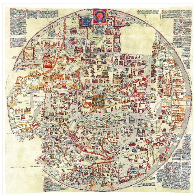
Figure 3. The Ebstorf Mappa Mundi.

These works must also be perceived as personal scientific erudition of the meaning then assigned to people and things, imbued with the Christian faith, considered the matrix of everything, together with the concept of travel and the condition of journeying towards sacred places. A condition therefore emerges that leads one to observe these masterpieces of art, faith, and cartography in an almost aesthetic way, pervaded by fervent admiration, especially if confronted with two of these works of art, perhaps the most famous and admired for their quality but also their size: the Ebstorf globe and Hereford globe. The former was discovered by chance in the Benedictine nuns' convent in the town of Ebstorf in Lower Saxony before being destroyed by Allied bombings in 1943.