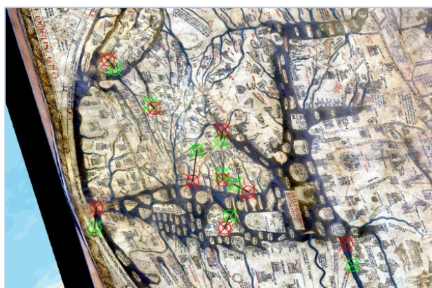
Figure 5. The “georeferencing” of the Mappa Mundi with real and represented positions.

In order to understand the geographical awareness of Hereford’s map for the purposes of attempted targeted analysis for this research paper, we carried out a sort of thematic georeferencing, i.e., by single continents, using the techniques of historical cartography to which the scientific community is now well accustomed, and achieving results that do not seem to be pure coincidence. Google Maps was used as a point of reference, which implements the Mercator projection modified by Plate Carrée and adapted to the WGS84 (World Geodetic System). Admittedly, the comparison is technically