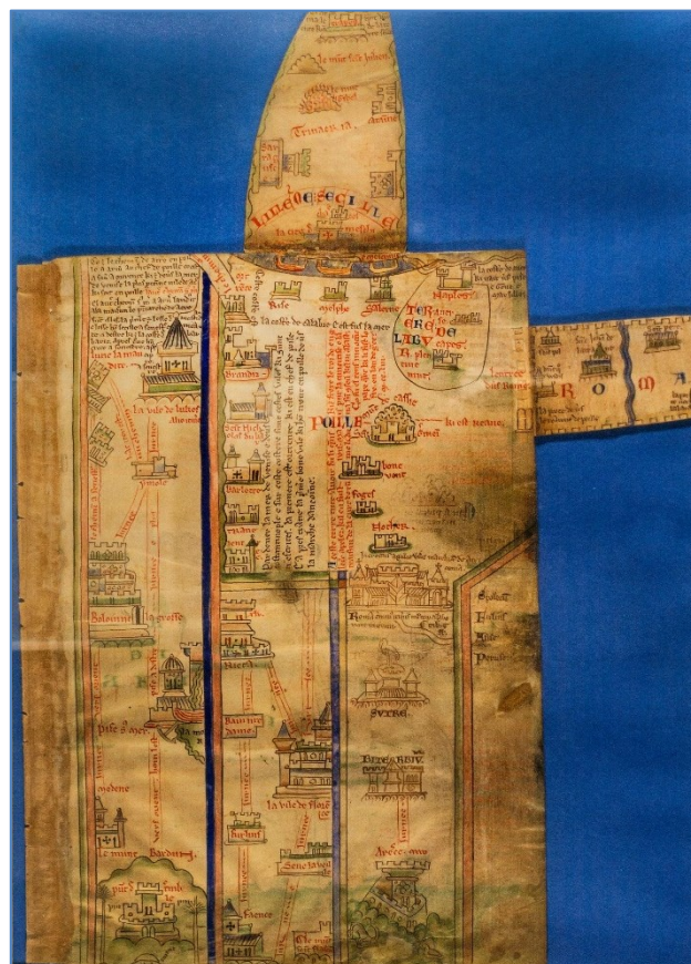
Figure 2. Matthew Paris, Iter de Londinio in Terram Sanctam , route from Pontremoli to Sicily.

of a book with additional foldouts on some pages as a further explanation of certain locations. The path of the (likely) pilgrimage that winds from one location to another is indicated by a fairly regular set of double lines inside which the name of the road is written along with drawings of details relating to each place reachable by the itineraries: towns, castles, churches, including characteristics of the places mentioned with their respective names written in red and blue. This work, which has been called innovative for the way it combined the idea of an itinerary with that of a map (Wilkins, 1977), is certainly the forerunner of today’s road maps (Wilford, 1981) and is worth examining in-depth in both a cartographic nature and also for historical purposes, although Cantile (2013, p. 131-134) has already conducted a respectable summary from this point of view. For the quantity of information and descriptions relating to important locations, it can also be reasonably considered a precursor of the more modern representations of cultural itineraries or religious routes, even though there is a lively debate among scholars about the true purpose of this work, whether it was intended to represent the sacred path for pilgrims to follow from London to Jerusalem, or rather if it delineated their return journey.