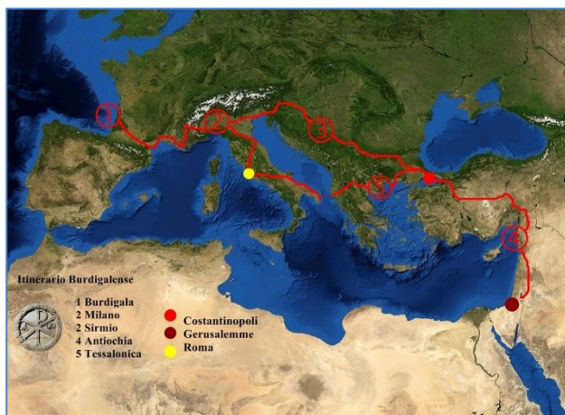
Figure 1. Reconstruction of the Burdigalense itinerary ( http://burdigale.weebly.com/il-cammino.html ).

documented not just geographically (Siniscalco and Scarampi, Ried., 1985). However, the delineation of the routes, the representation of the itineraries, the tracing of these great journeys on maps, appeared much later. Following the end of the great Occidental and Oriental empires and the formation of numerous circumscribed political entities, the very concept of travel and trade changed, and therefore the great Roman road system was abandoned and fell into disuse except on a local level.